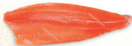
Whole Trim - E

Fillet skin on, frozen VP. Size 1-2, 2-3, 3-4 lbs. 10 and 25 kg box.