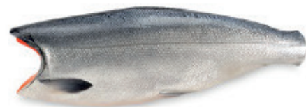
Whole Trim - C

Fillet skin on, frozen VP. Size 1-2, 2-3, 3-4 lbs. 10 and 25 kg box.