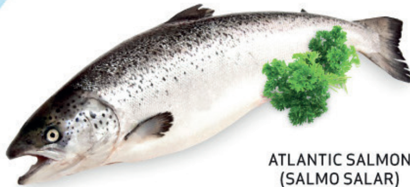
ATLANTIC SALMON (SALMO SALAR)